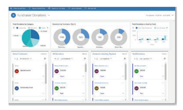
Power Apps streamlines complex tasks and projects, such as this example donation management app